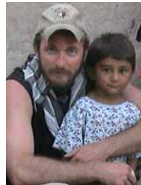
MAJOR JIM GANT UNITED STATES ARMY SPECIAL FORCES

There is no doubt it could be done again.