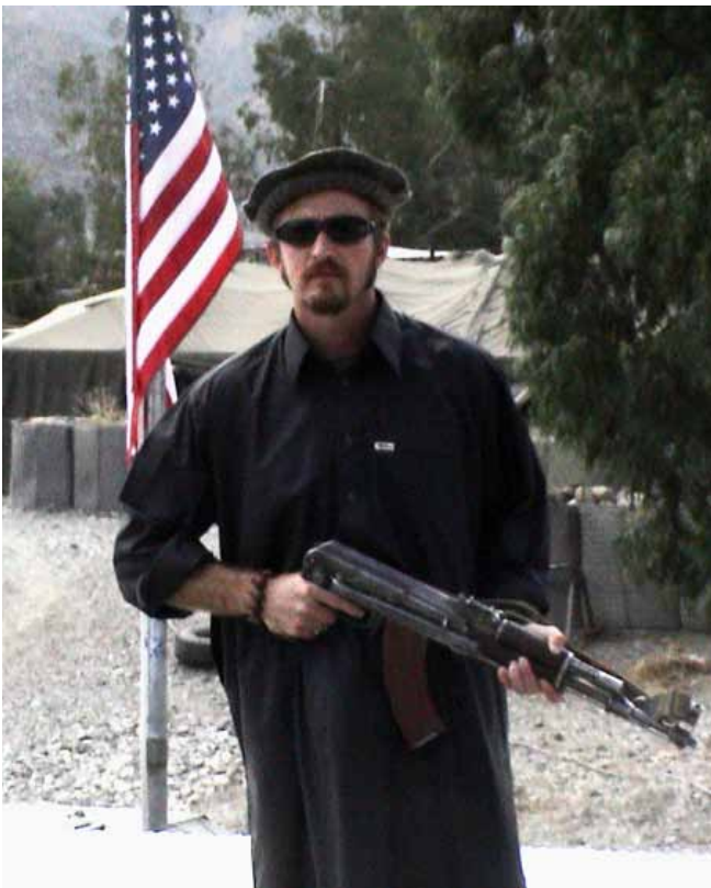
For some of our missions we dressed in Afghan garb, especially when we didn’t want the Taliban to know our teams were operating in certain areas. Here I’m in the local garb with AK-47 ready to go. This is my favorite personal photo from Afghanistan.

BOTTOM LINE: The GIROA (Government of the Islamic Republic of Afghanistan) must find a way to incorporate the historical tribal structures into the national political system. It will not look like anything we can envision at this point, and may vary from province to province or even from tribe to tribe. But it can be done. Tribal Engagement Teams can help facilitate this. ▶◀